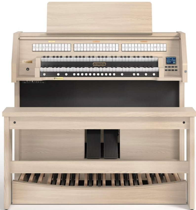
DOMUS 4 (light, dark lam.oak)